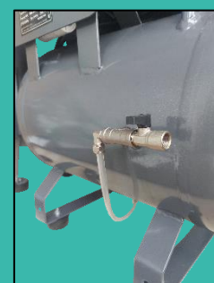
Clear View Drain

Kingdom Air RX oil free compressors have been designed from the ground up to offer users the most reliable source of compressed air on the market whilst maintaining low noise levels. Utilising only the best components from well-known brands such as Condor and Airtac, the RX range features 100% duty rated motors and our innovative “clear view drain” system which allows you to visually see if the tank has any water inside it. With standard working pressures of 8 bar (and 10 bar available on request), RX compressors are able to consistently deliver high quality, oil free air. With the optional desiccant dryer, dewpoint levels can be reduced as low as -40°C for when air is to be used with sensitive components. The entire RX range can be run off a single 13 amp plug and has noise levels as low as 60 dB(A). With low service costs and a comprehensive 2 year warranty covering mechanical parts, and 5 year warranty on the internally coated tank, you can rest assured you are well protected when you choose a Kingdom Air compressor.